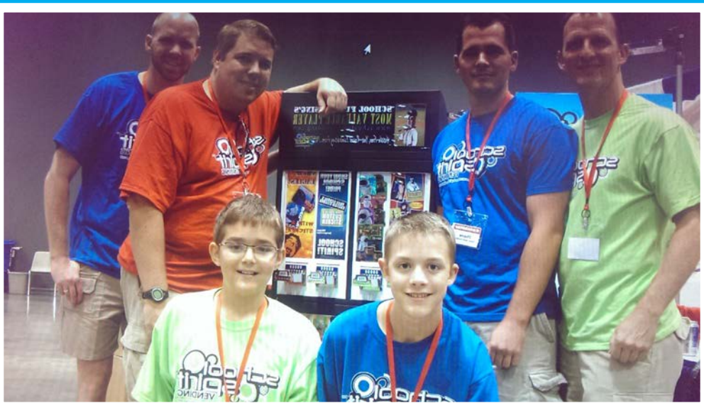
2ND TRADE SHOW, 2008